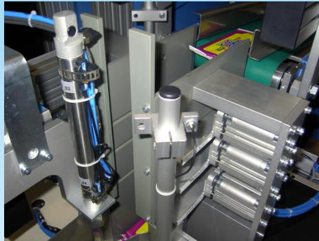
DOWN STACKING WITH SERVO PUSHERS